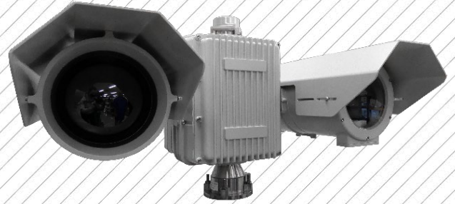
Above: Jaegar Ranger EVO2 HD 25-225mm. Other models will vary.

The Jaegar EVO2 HD is a high performance, multi sensor platform which utilises long range uncooled LWIR HD thermal sensors with a range of zoom lens options up to 30-300mm, alongside the latest low light HD visible sensor with zoom lens options up to 20-2400mm. The EVO2 range employs the latest 12µm thermal technology which has push autofocus capabilities as standard.