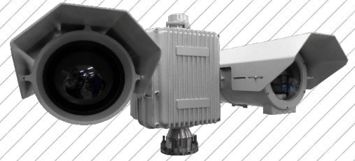
Above: Jaegar Ranger EVO2 HD 25-225mm. Other models will vary.