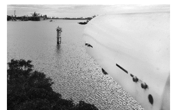
HIGH ACCURACY Designed for long range surveillance applications