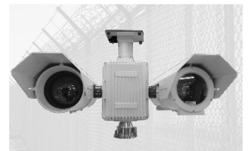
THROUGH SHAFT Enables fixed payloads to be mounted above the PT Director